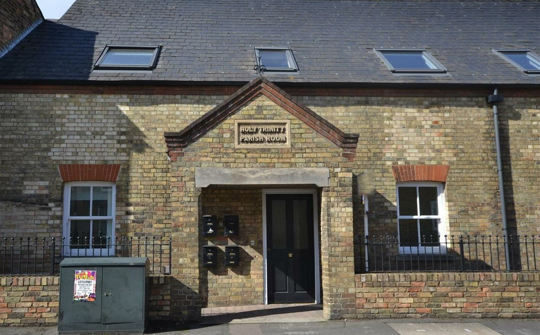
Trinity Hall, Ely, CB7 4PG